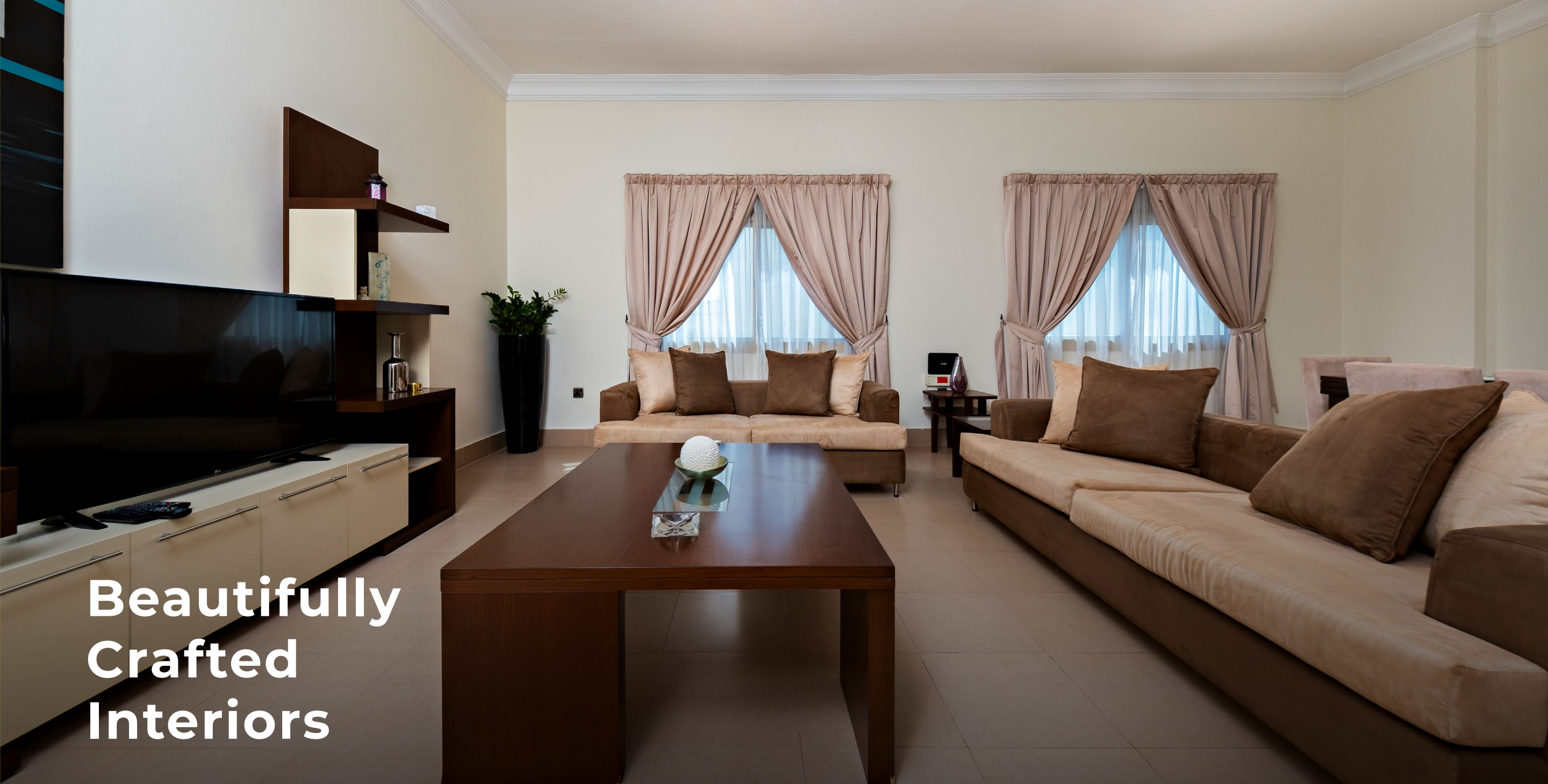
Beautifully Crafted Interiors